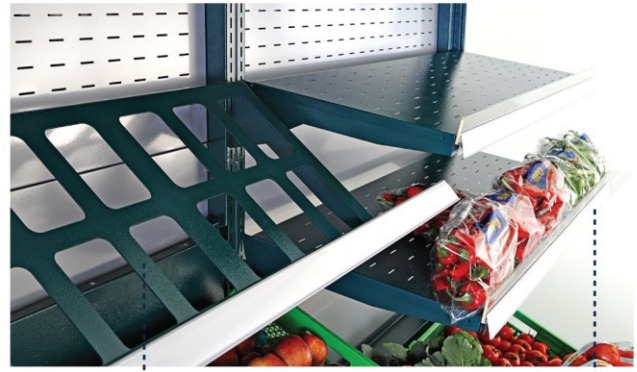
Shelving - W