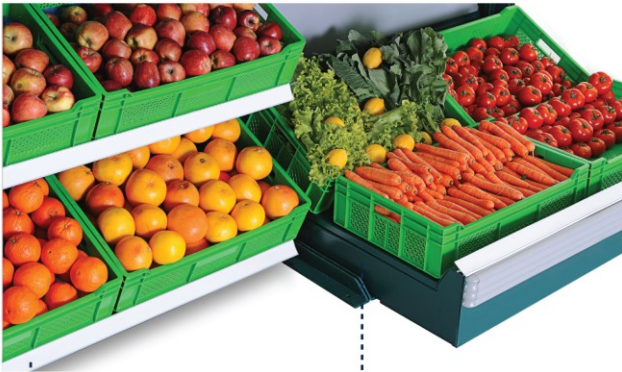
Base shelves - B